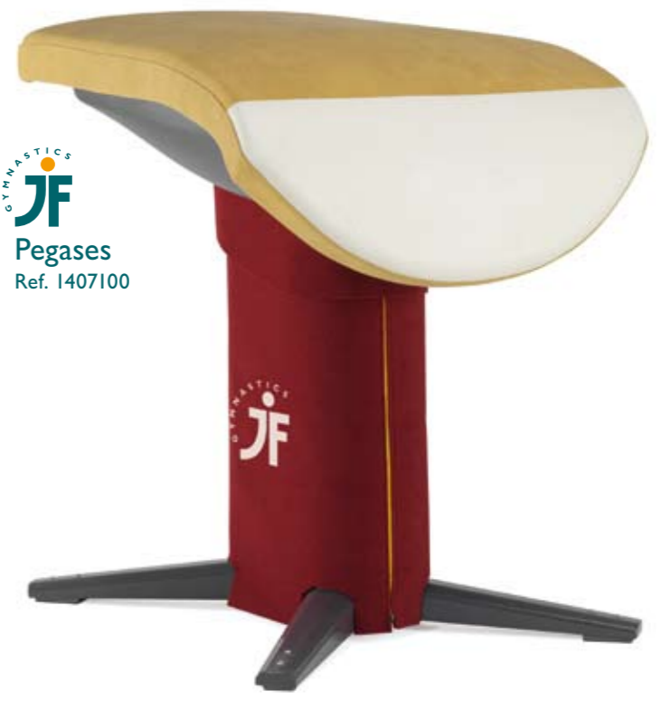
JF GYMNASTICS Pegases Ref. 1407100