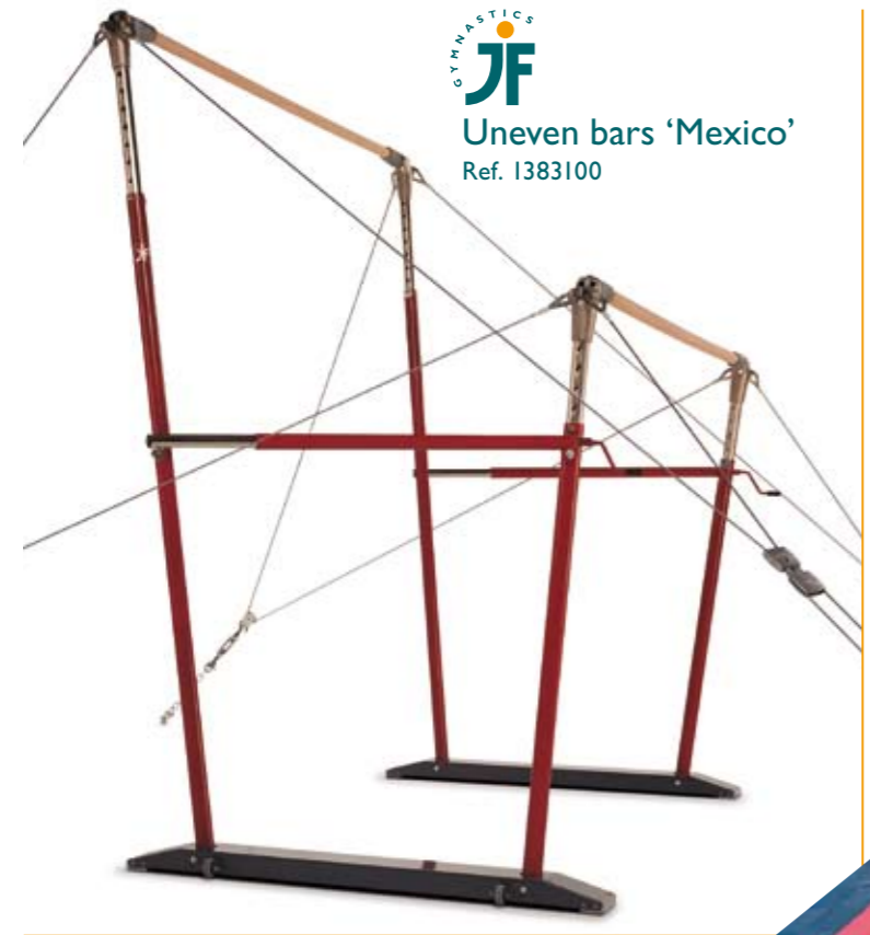
JF GYMNASTICS Uneven bars 'Mexico' Ref. 1383100