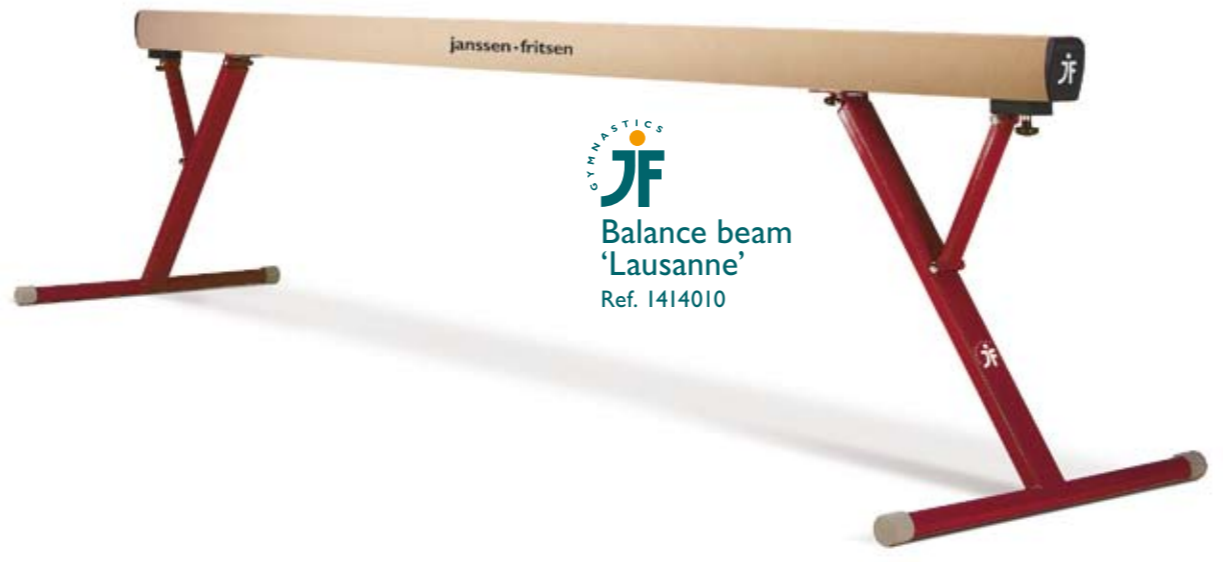
JF GYMNASTICS Balance beam 'Lausanne' Ref. 1414010