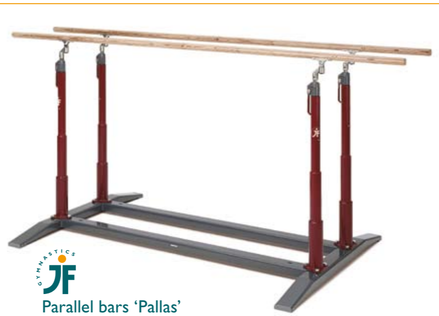
JF GYMNASTICS Parallel bars 'Pallas' Ref. 1403170