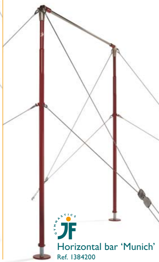
JF GYMNASTICS Horizontal bar 'Munich' Ref. 1384200