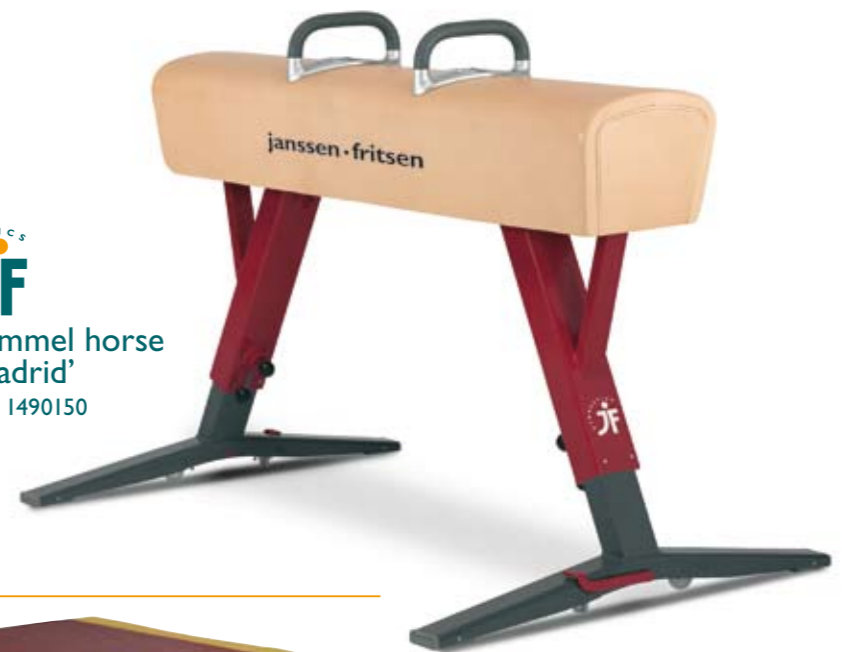
JF GYMNASTICS Pommel horse 'Madrid' Ref. 1490150