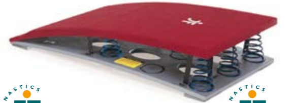
JF GYMNASTICS Springboard hard 'Kreon' Ref. 1411440